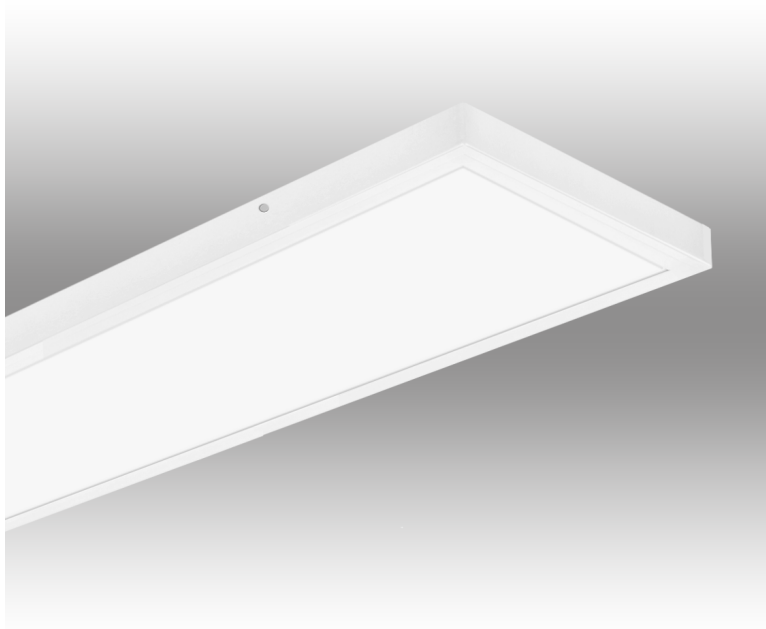
overall dimensions (mm)

LED panel, ceiling-mounted power: 50 W, light color: neutral index: OS-ONP512-40